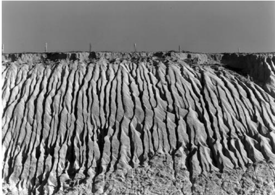
Nr. 501101. Highway 1, near Carmel, California. 1950