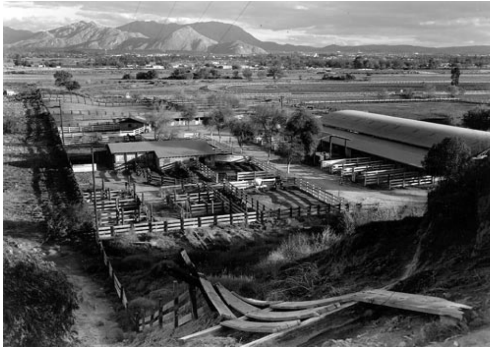
Nr. 790111. Horse Ranch, Riverside, California. 1979