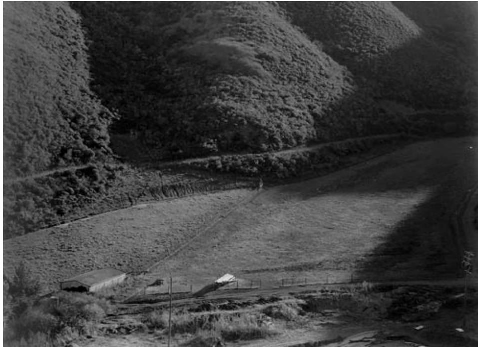
Nr. 661213. Near Halfmoon Bay, California. 1966