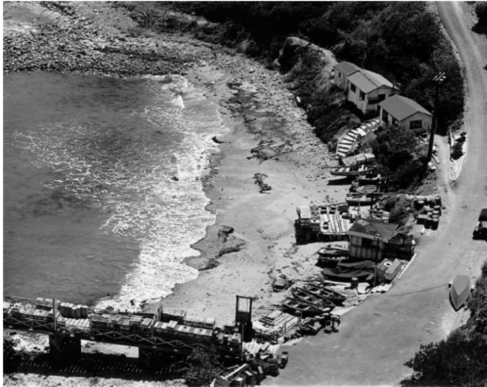
Nr. 46-5. Dana Point, California. 1946