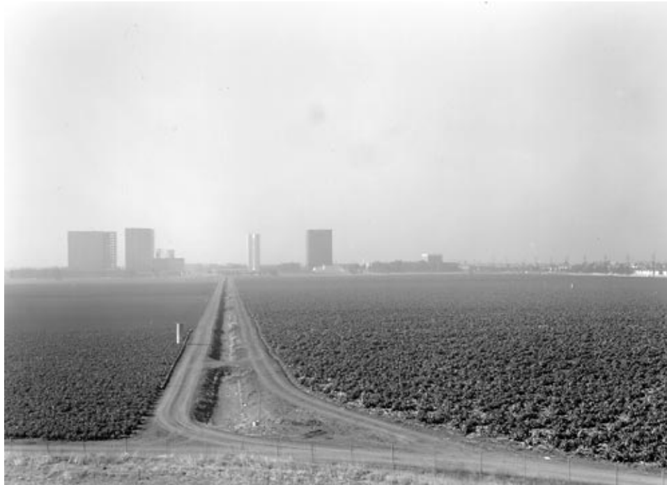
Nr. 810102. Bean Field and Smog. 1981