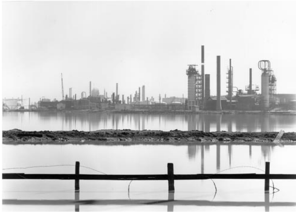
Nr. 521101. Richmond, California. 1952