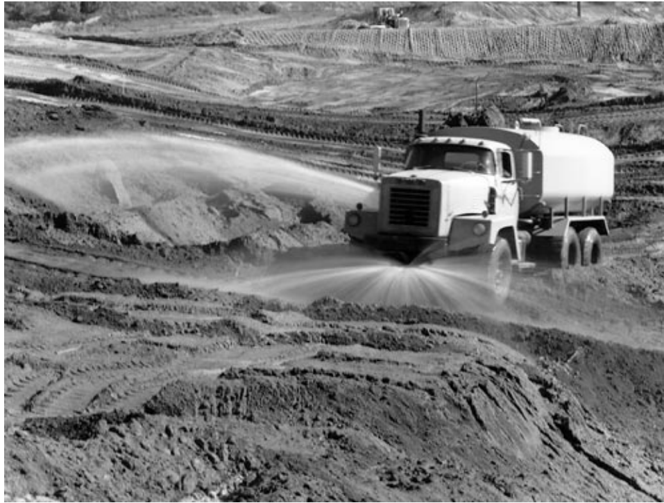
Nr. 870223. New Lots for New California, Riverside, California. 1987