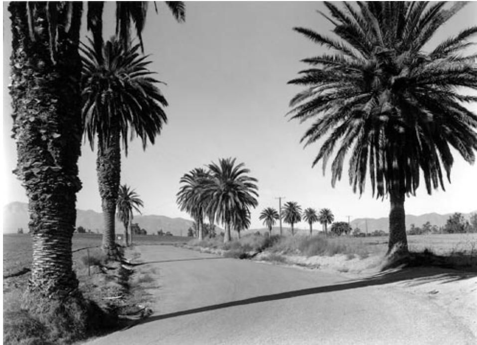
Nr. 790202. North Main Street, Riverside, California. 1979